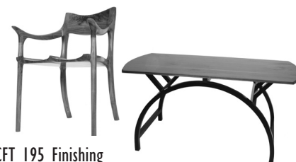
Table and Chair Manufacturing