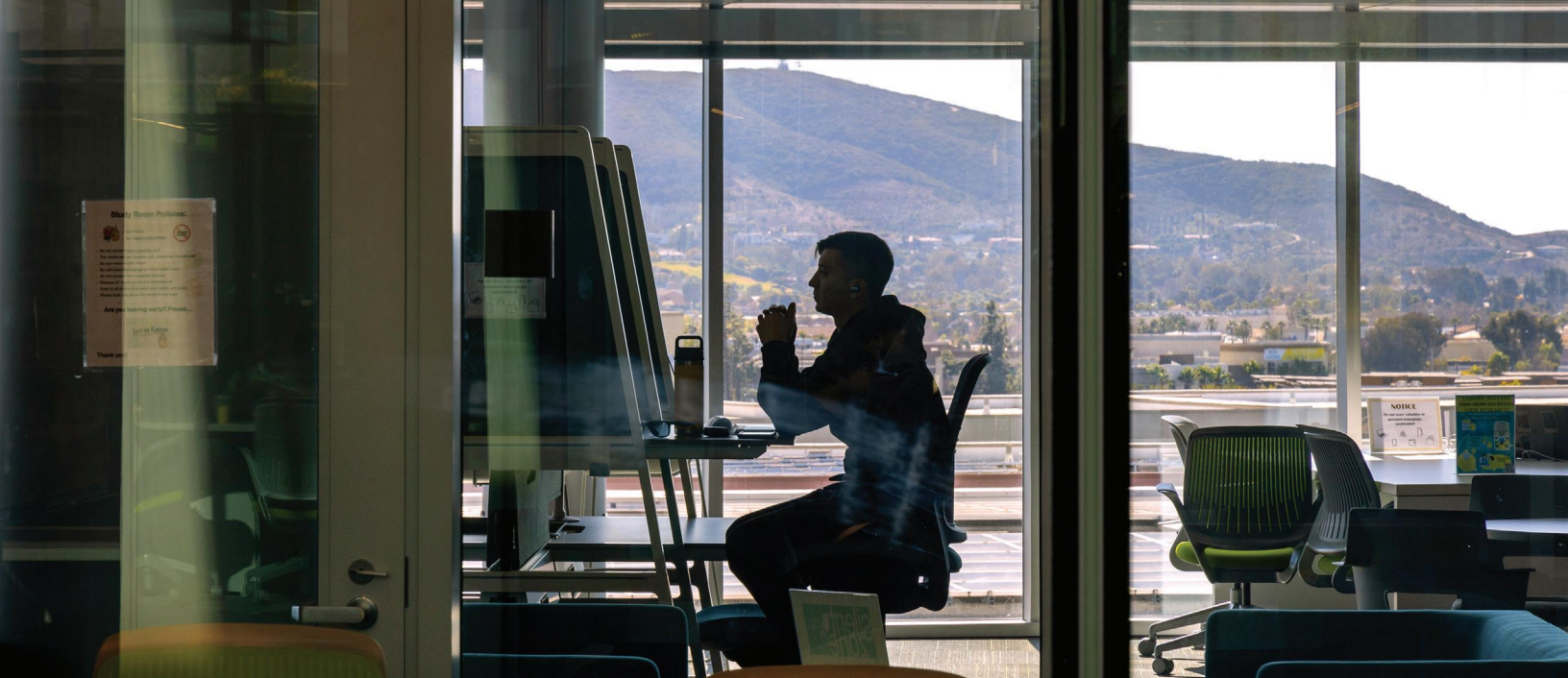
San Marcos Library and Learning Resource Center