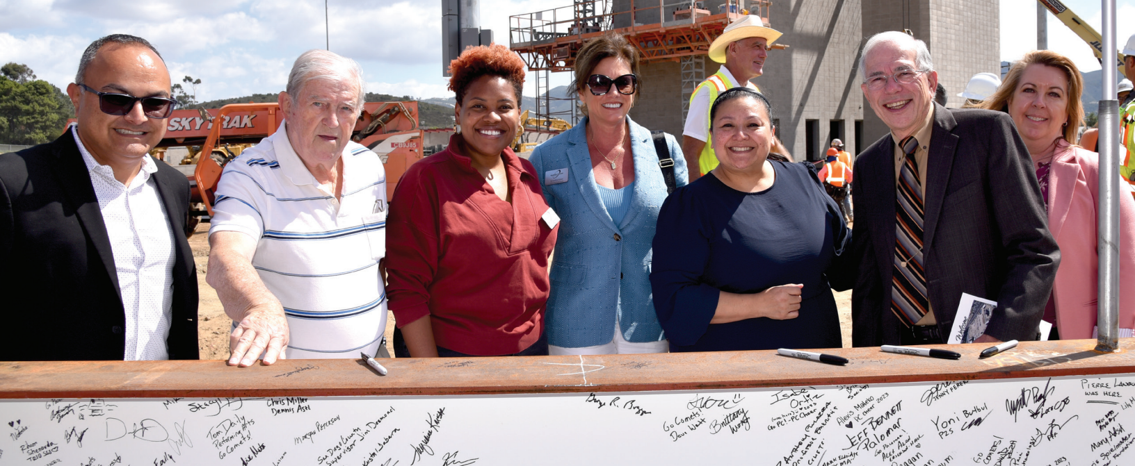
Topping Off Ceremony of Football and Softball Stadium