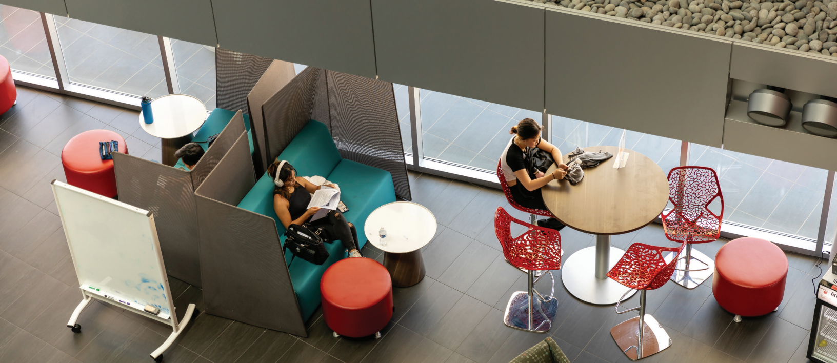
San Marcos Library Resource Center