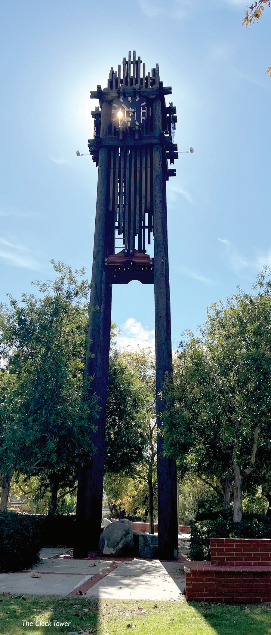
The Clock Tower