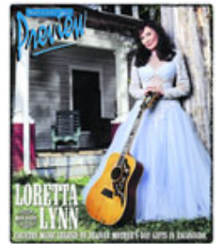
Arts & Entertainment Magazine