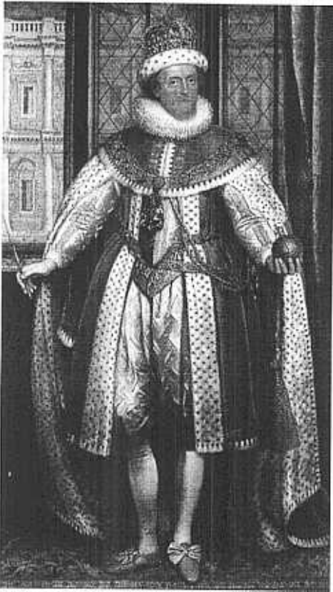
PRINTING BY PAUL VAN SOMER, ROYAL COLLECTION, WINDSOR CASTLE

But the New Testament is a different matter. Textual critics have to deal with a staggering number of manuscripts in every degree of quality—nearly 25,000 altogether—divided into four major families: Alexandrian, Western, Caesarean and Byzantine. Each of these text families is named after the geographical region in which it was produced, and each has distinct characteristics.