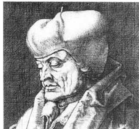
Desiderius Erasmus, whose hastily-assembled and error-filled Greek New Testament text was used to produce the King James Version.

A "translation" like this would be useless to anyone who didn't