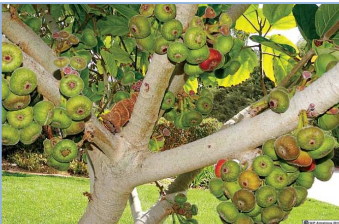
Roxburgh Fig ( Ficus auriculata ): A cauliflorous species distributed from India to China with large syconia produced on the trunk and limbs. Like the other 800+ species of Ficus , it requires a minute, symbiotic wasp for pollination.