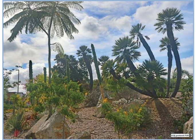
This garden near the Performing Arts Complex is a mixed planting that includes the Brazilian Fern Tree ( Schizolobium parahyba ).

is home to a faux lava field and rainwater-filled water feature; a Cactus and Succulent Garden near Mission Road and Comet Circle features more than 3,000 species; plus many California Native Gardens and other gardens that are scattered throughout the campus.