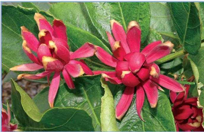
Spicebush ( Calycanthus occidentalis ): A fragrant California shrub native to the foothills of the Sierra Nevada. It belongs to its own North American family, the Calycanthaceae.