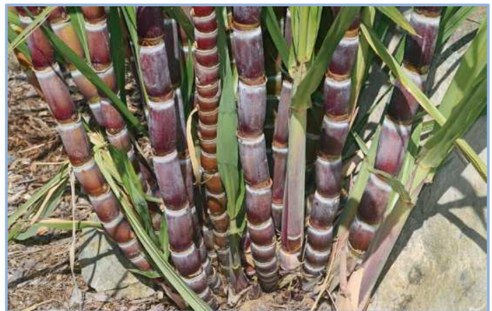
Sugar Cane ( Saccharum officinarum ): One of several colorful varieties of sugar cane planted in the Polynesian Garden.