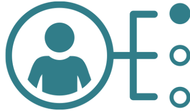
Custom Coverage Options