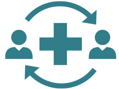
Recurrent Diagnosis Benefit

americanfidelity.com/info/critical-illness