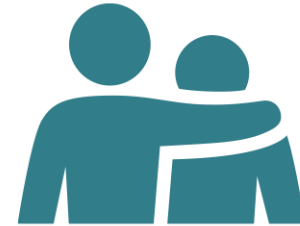
Employee Assistance Program