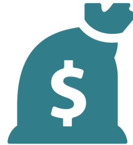
Lump Sum Benefit