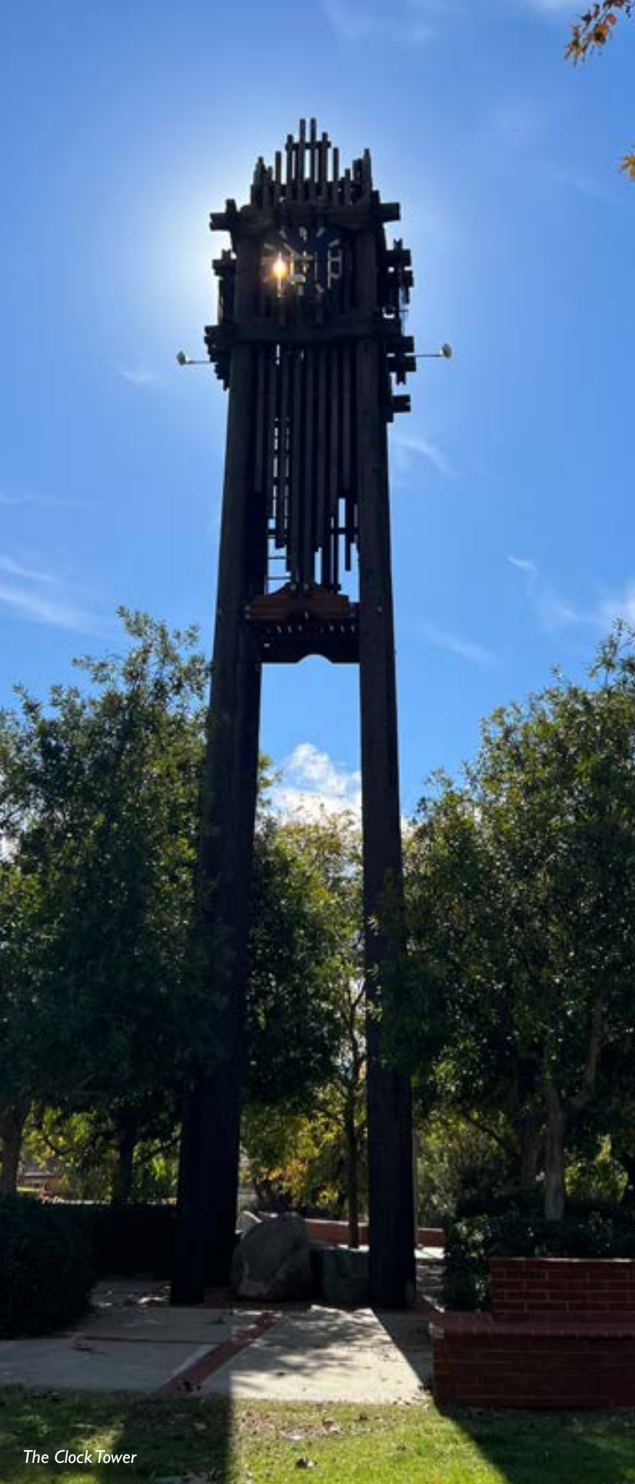
The Clock Tower