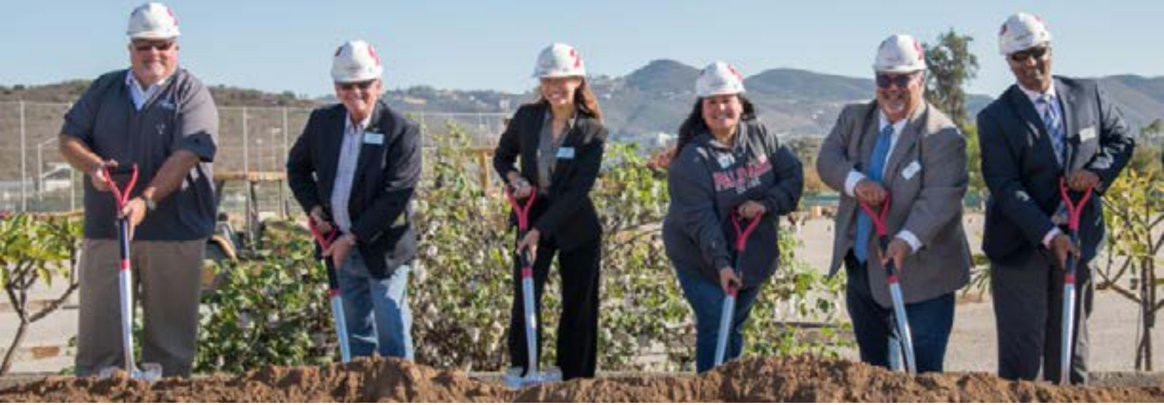
Groundbreaking on Football and Softball Stadium