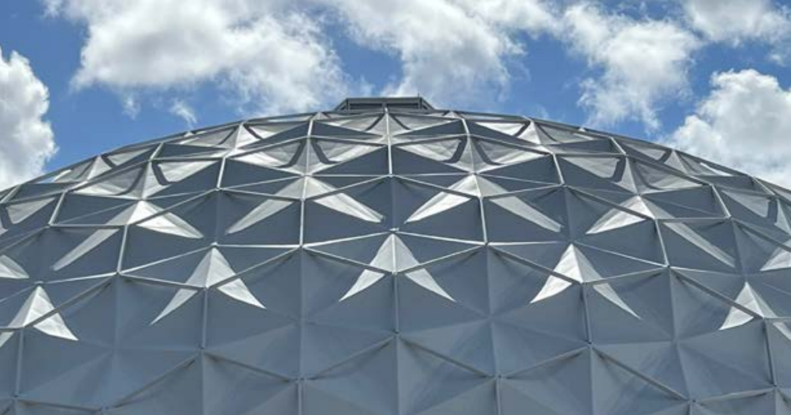
San Marcos Campus Gymnasium/Dome