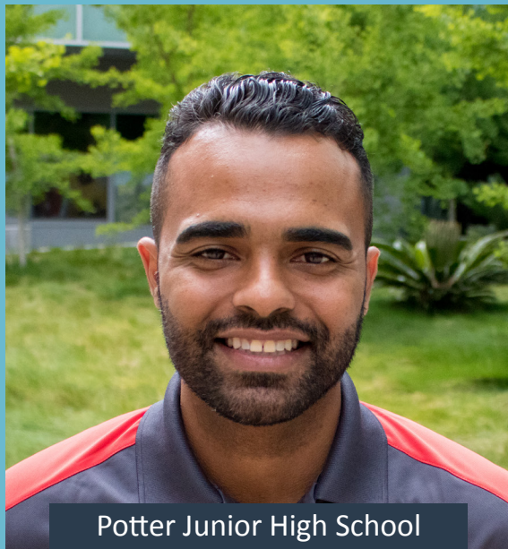
Potter Junior High School