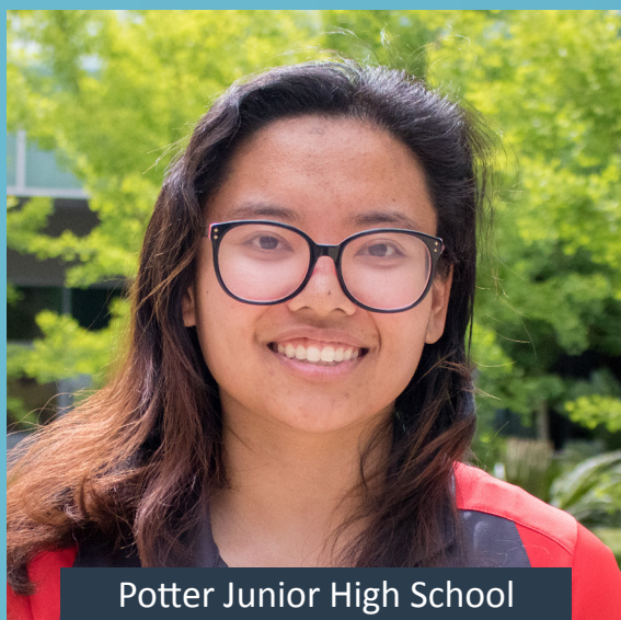
Potter Junior High School