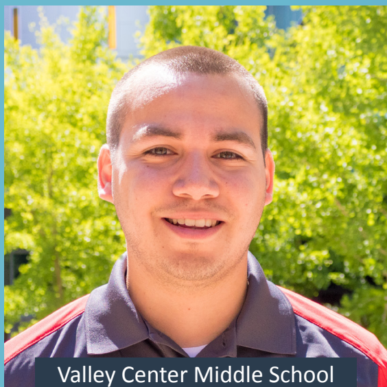
Valley Center Middle School Pauma School