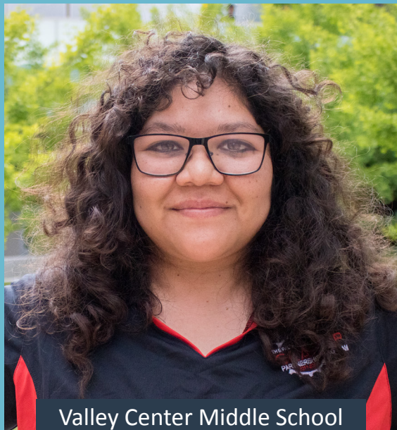
Valley Center Middle School Pauma School