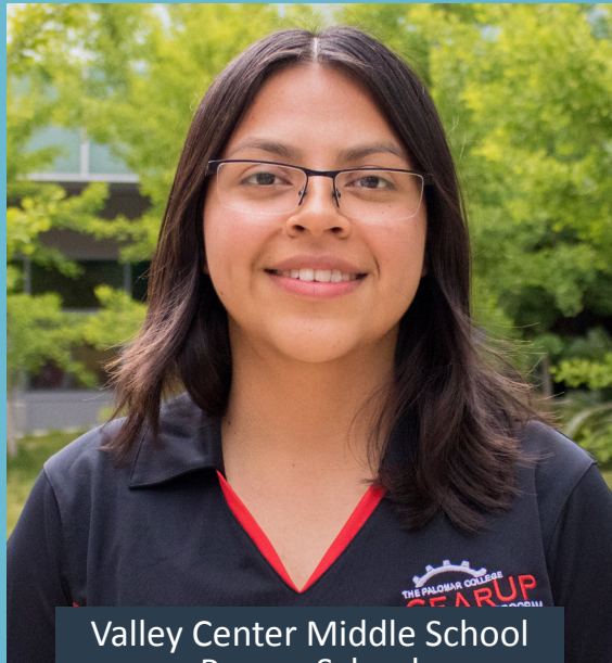
Valley Center Middle School Pauma School