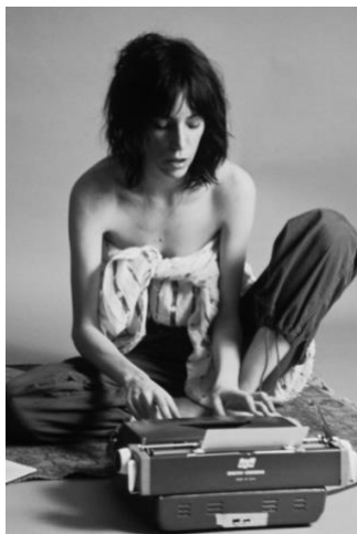
Patti Smith at work

"Stately, plump Buck Mulligan came from the stairhead, bearing a bowl of lather on which a mirror and a razor lay crossed." James Joyce - Ulysses