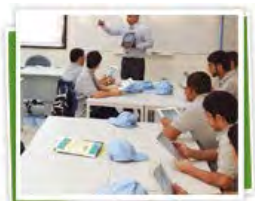
Secondary Technical Schools (STS) View PDF