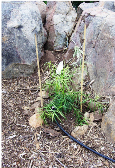
Podocarpus daweyi was recently added to the primitive garden. A rare species, it originates in Africa and is very similar to the African fern pine Podocarpus gracilior .

Palms, and the whole host of flowering plants that cover our globe today.